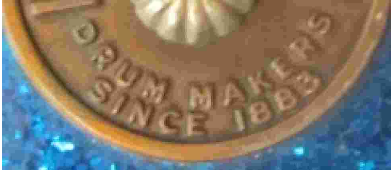
Detail of Thick Stick/Large Font Badge (author)