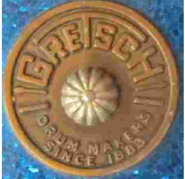
Thick Stick/Large Font Badge (author)

Pictures of Thick Stick/Large Font Badge: