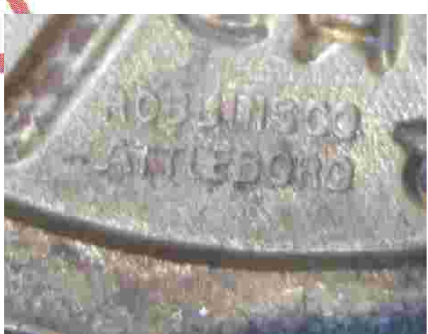
Detail of "ROBBINS CO ATTLEBORO" mark. Date Unknown (author)