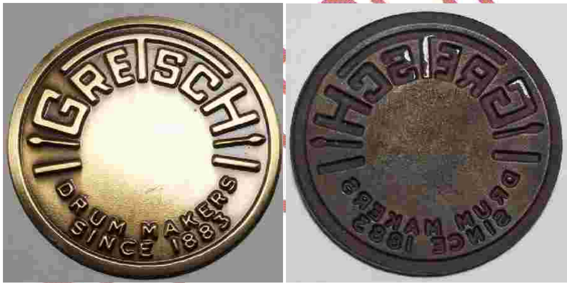
Apparent Reproduction Badge (Bill Maley)