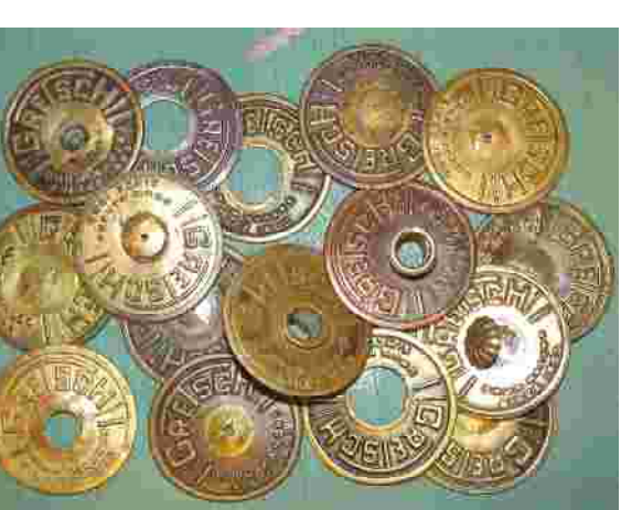
Badges salvaged from damaged drums (Bill Maley)