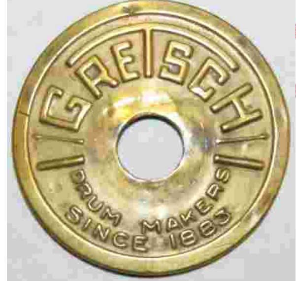
"ROBBINS CO. ATTLEBORO" on obverse, textured finish. Date Unknown (author)

Pictures of Robbins Co. Textured Skinny Stick Badge