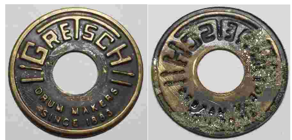
Apparent Counterfeit Badge - Note inconsistent angles of sticks. (Bill Maley)