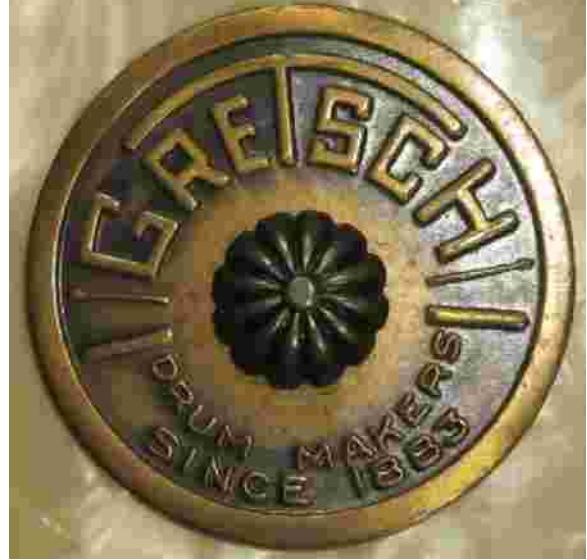
9x13 Tom, JUN 19 1952 (author)

Pictures of Textured Skinny Stick Badge: