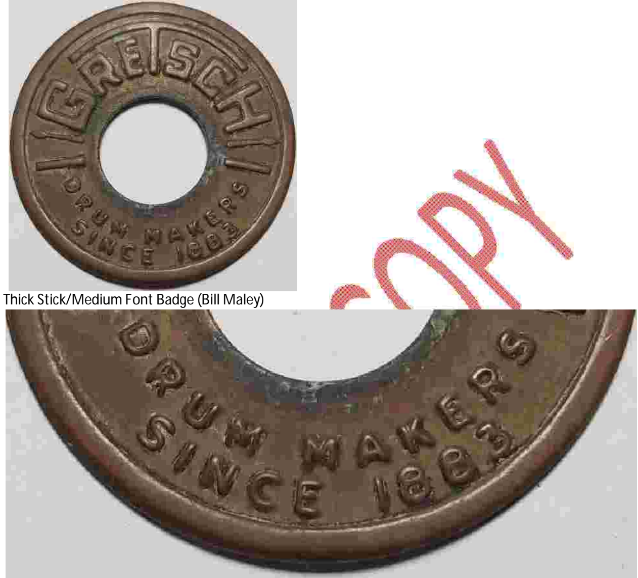
Detail of Thick Stick/Medium Font Badge (Bill Maley)

Pictures of Thick Stick/Medium Font Badge: