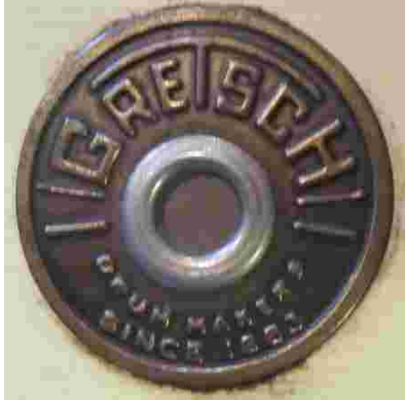
Skinny Stick/Small Font Badge from 6x14 Snare, Skinny Stick/Small Font Badge from 5x14 Snare, 3 ply, unpainted interior, circa 1940s-1953 (author)

Pictures of Skinny Stick/Small Font Badge: